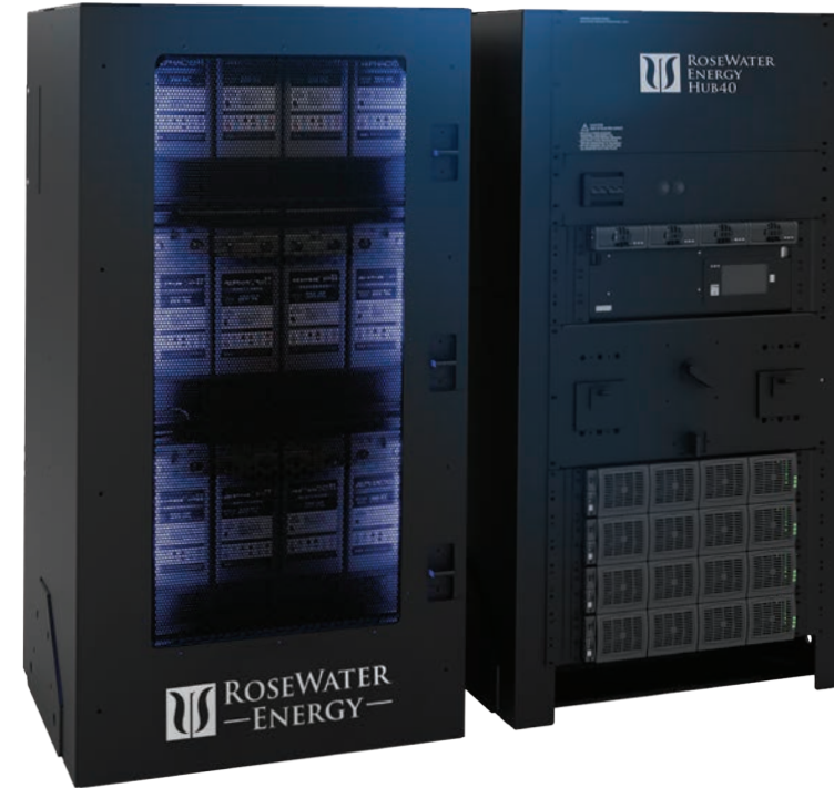
ROSEWATER HUB40 40 kW/200 Amp Continuous Power Output

RoseWater Energy is committed to delivering category-leading, highly reliable, and sustainable energy management solutions.