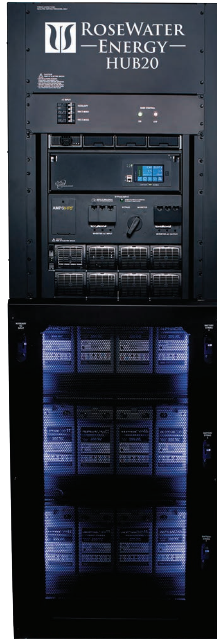
ROSEWATER HUB20 20 kW/100 Amp Continuous Power Output

Simply put, RoseWater Energy's complete solutions ensure peace of mind for home and property owners.